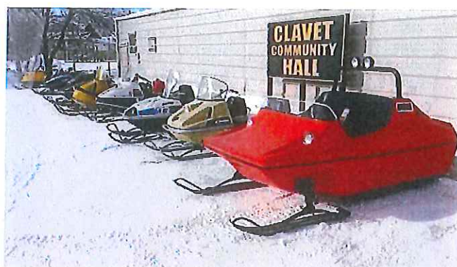
Snowflakes Vintage Snowmobile Club

We will be maintaining our permit and will still be able to supply alcohol for functions.